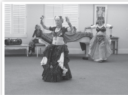
The Silk Road Dance Collective Group gave an outstanding belly dancing performance!